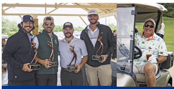
2024 GOLF CLASSIC TOURNAMENT THURSDAY, APRIL 18