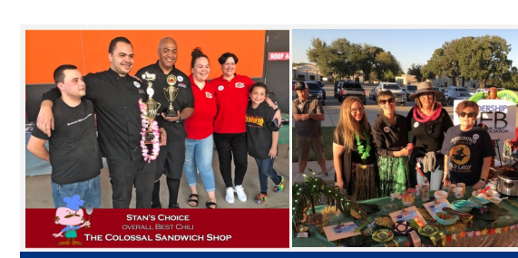
29TH ANNUAL CHILI CHALLENGE THURSDAY, OCTOBER 17