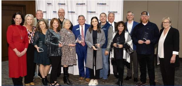
ANNUAL AWARDS LUNCHEON FRIDAY, JANUARY 17