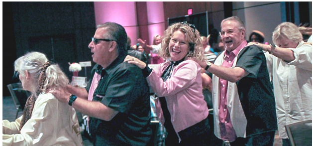
ANNUAL ANNIVERSARY EVENT SATURDAY, SEPTEMBER 20