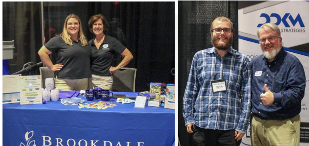
2025 EXPO TUESDAY, JUNE 3