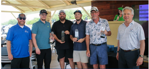
2025 GOLF CLASSIC TOURNAMENT THURSDAY, APRIL 24