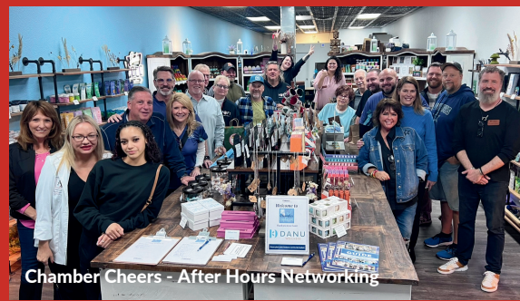
Chamber Cheers - After Hours Networking

Preeminent Business Resource for the Community