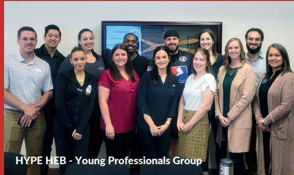
HYPE HEB - Young Professionals Group

Advancing Business, Strengthening Community