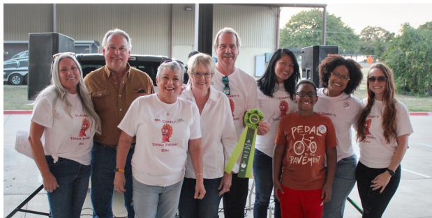
30TH ANNUAL CHILI CHALLENGE THURSDAY, OCTOBER 16