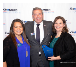
HEB CHAMBER OF COMMERCE COMMUNITY SERVICE AWARD Mission Central